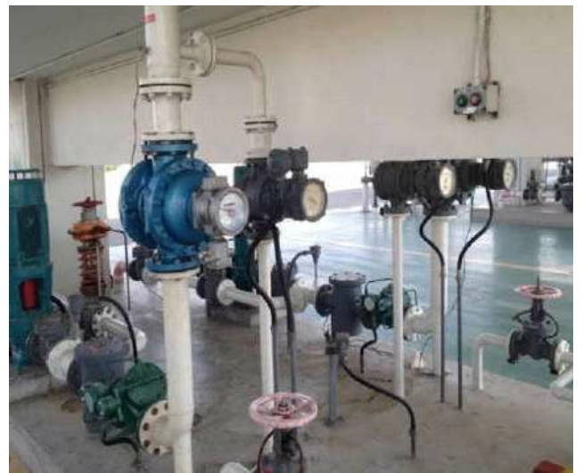
Klinger LC 170820